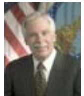
Ed Schafer Sec. of Agriculture